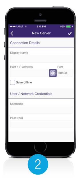
Configure your server connection for convenient operation, or scan a QR code to automatically populate server details with the correct information.