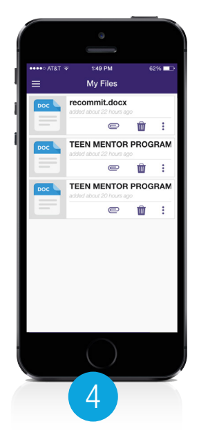
Attach one or more files to be processed, stored or shared.