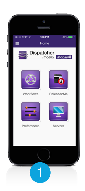
Access the Dispatcher Phoenix Mobile app on your smartphone screen.