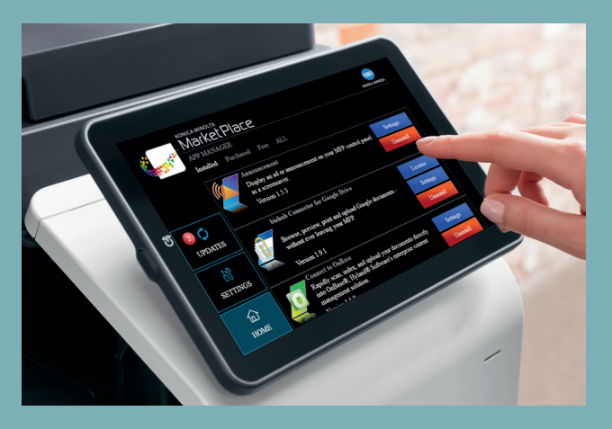
For more details on Konica Minolta MarketPlace, visit konicaminoltamarketplace.com