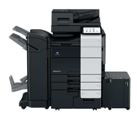
bizhub i-Series 950i