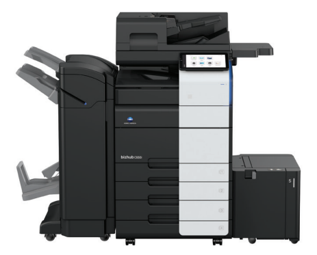
bizhub i-Series C650i